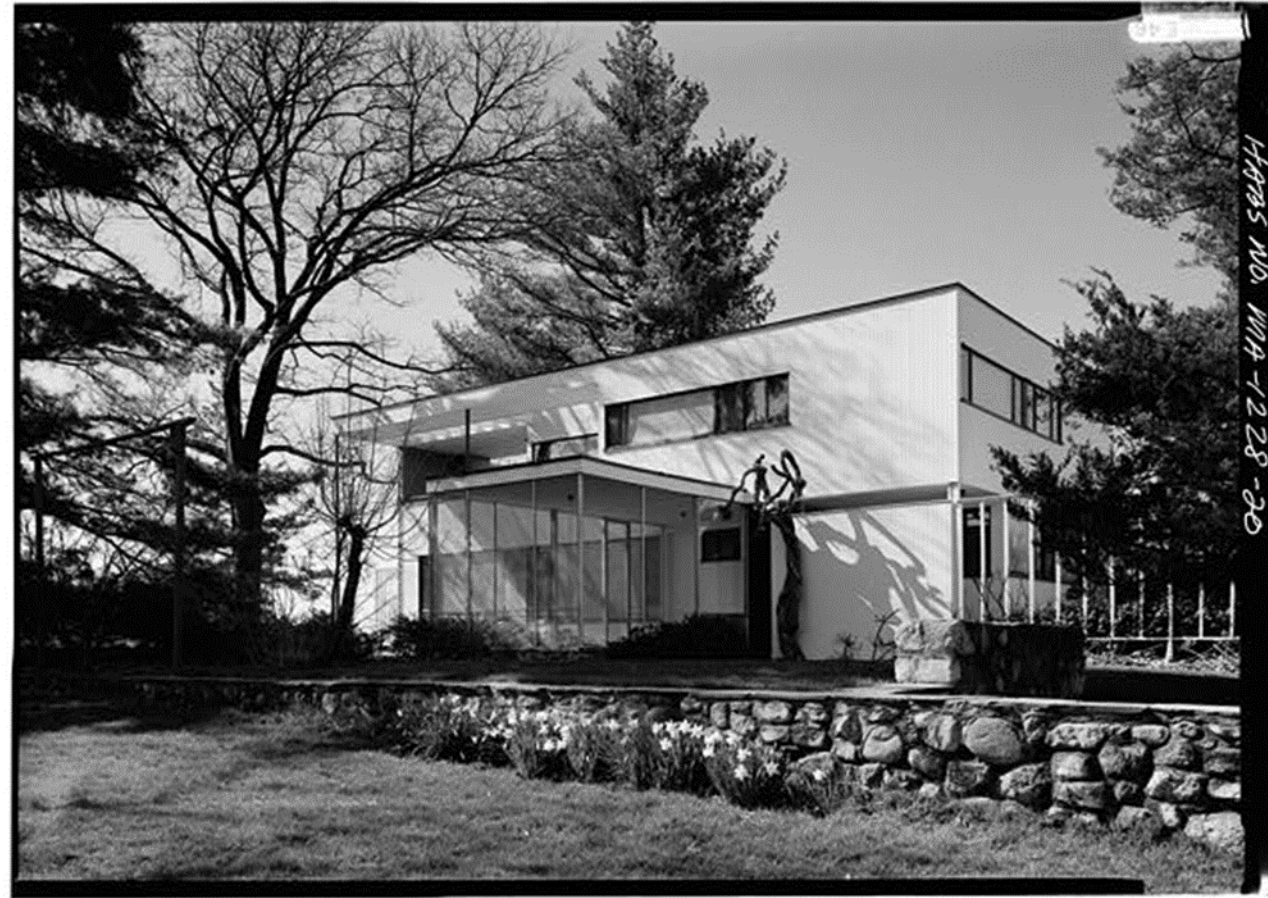
Gropius House, 1938, Lincoln, Massachusetts, Walter Gropius