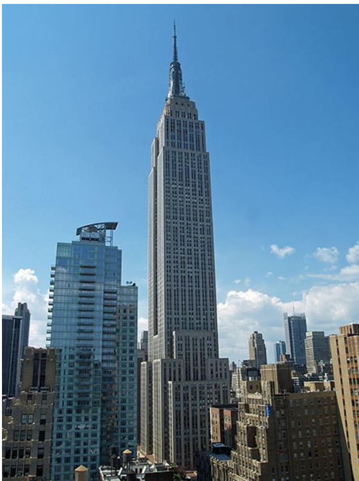
New York's Empire State Building, 1931, Once the world's tallest structure