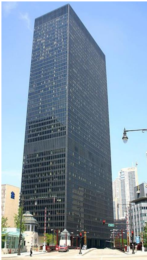
IBM Plaza, Chicago, Illinois, Ludwig Mies van der Rohe, the International style