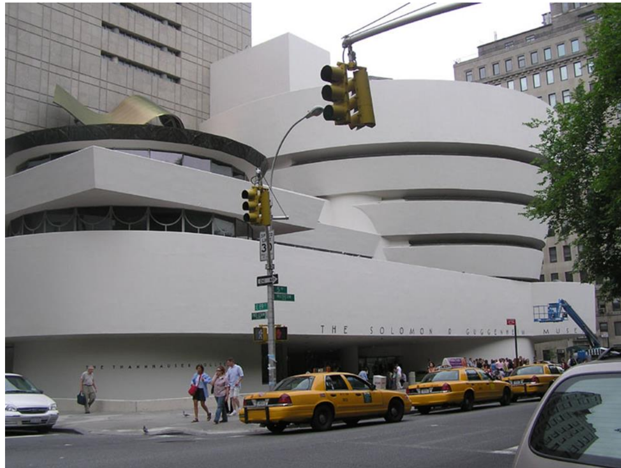
Solomon R. Guggenheim Museum, NYC, New York, 1959, Frank Lloyd Wright